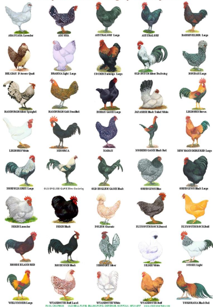
Poultry Breeds from Paintings by Paul Chapman©

“Wow! I thought there were a lot of breeds of horses , but check out all these ‘different by design’ chickens! !”